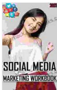
Image Alt Attribute: Social Media Marketing Workbook cover featuring a vibrant and engaging design, with a laptop displaying various social media platform icons.

Don't miss out on this opportunity to transform your social media presence and drive measurable results for your business.